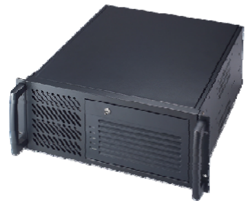
CO-Commercial 19" rack

The VIGIL DRX series Digital Video Recorder (DVR) features the latest developments in recording technology. A truly hybrid DVR with the ability to record 4-32 analog or IP based cameras. The DRX series DVR is capable of a recording rate of 30-240 images per second at 352x240 NTSC, 352x288 Pal. The built in video matrix 32x2 (DRX50/100/200 series) is capable of displaying both IP and analog based cameras combined. These versatile units are ideal for demanding video recording applications such as those found in Retail, Airports, distribution facilities, and other application requiring high quality recording.